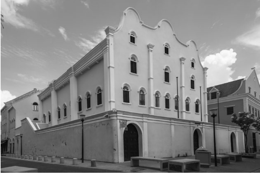
1732 Mikvé Israel-Emanuel synagogue, the oldest in continuous use in the Americas.

nor contradicted.” One might wonder: Why did the congregational membership repeatedly ratify haskamoth that gave such extensive powers to the mahamad? This article examines what gave the mahamad the power to exercise such dominant governance and religious control from the seventeenth to the nineteenth centuries.