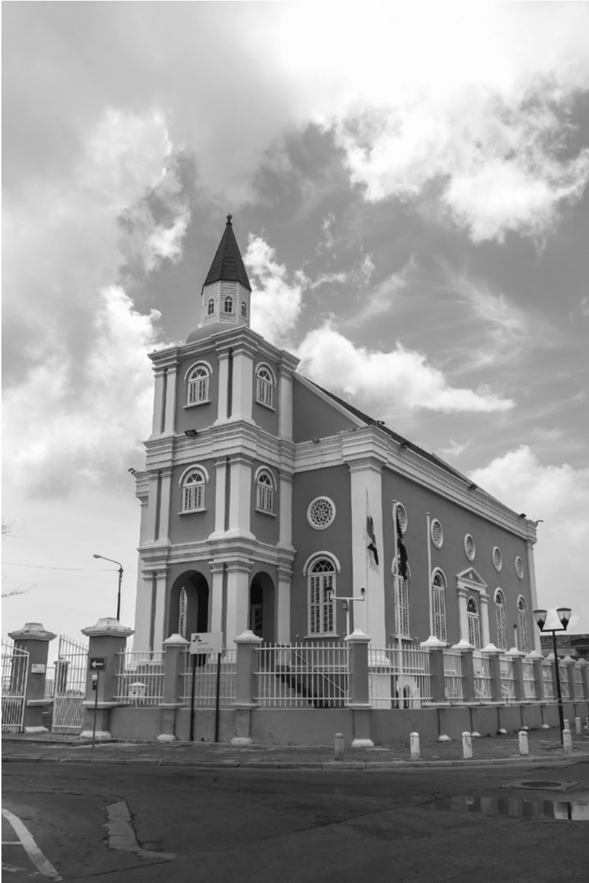
Temple Emanu-El, 1864-1964. Currently not used as a house of worship.