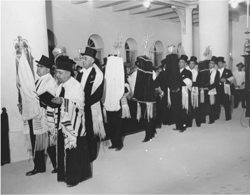
Three hundredth anniversary celebration of Mikvé Israel, 1954.

It may well be that this view of the Reform congregation, coupled with the settlement of a larger number of Ashkenazi Jews, stimulated Mikvé Israel to seek a solution regarding Ashkenazi membership that better reflected the times.